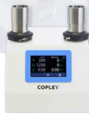
JV 200i with Method 3 platform

Acoustic Cabinet reduces the noise level produced by the JVi series unit