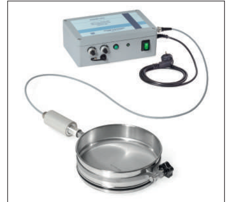
By the use of HAVER UFA the sieving of loose adhesive materials is made possible