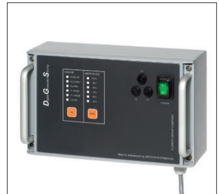
Digital generator for the simultaneous vibration of up to three test sieves (DGS35-50-T)