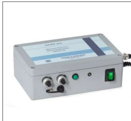
Analogue generator for the vibration of a test sieve (AGS35-100)