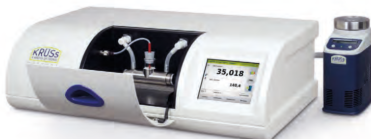
P8000-T with circulation thermostat PT31

When used in combination with polarimeters, the PT80 or PT31 circulation thermostats ensure uniform temperature control of the samples to be measured. This enables high-precision and reproducible measurements, such as those prescribed by different standards in the pharmaceutical industry at 20 °C or 25 °C. Water-temperable measuring tubes from all manufacturers can be temperature-controlled with our circulation thermostats and are connected in no time at all using the quick couplings for hoses integrated in our polarimeters.