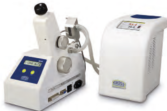
AR2008 with circulation thermostat PT80

The PT80 and PT31 circulation thermostats are often used for the sample temperature control of refractometers, whereby the temperature control of Abbe refractometers is particularly popular. Abbe refractometers can therefore achieve highly accurate and extremely reproducible measurement results completely independent of the ambient temperatures. The more powerful PT80 guarantees fast and stable temperature control of the measurement sample even in laboratories without air-conditioning. Both circulation thermostats are extremely small and can be very easily connected to all water-temperable refractometers.