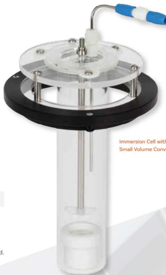
Immersion Cell with 200 mL Small Volume Conversion Kit