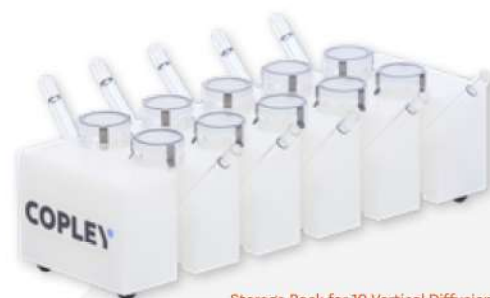
Storage Rack for 10 Vertical Diffusion Cells